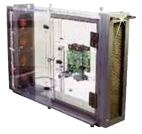
Figure 3 –Benchtop Thermal Evaluation Wind Tunnel (Omega Engineering, Inc.)

The latest application to emerge for these handy air flow devices is in everyday engineering design: thermal evaluation of electrical and electronic components. This includes active devices like circuit boards and powered components, and passive devices like heat sinks and heat exchangers.