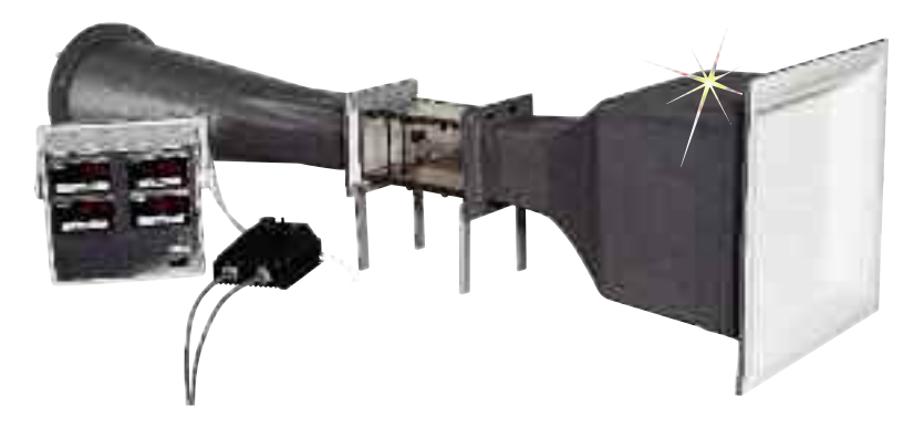
Figure 1 shows a typical benchtop wind tunnel (Omega Engineering, Inc., Stamford, CT). The transparent test chamber can be seen in the center. A fan on the left pulls air into the square opening on the right where a fiberglass honeycomb filter produces a uniform stream that is then shaped by the duct leading to the air chamber. This unit can be used for either calibration or air flow studies.

Benchtop wind tunnels are typically open-loop systems, which means that the air is drawn from and is expelled into the room, as opposed to the same air recirculating through a duct system or another closed path. Large or small, wind tunnels have certain key elements in common. Let's take a look at these. The test section or air chamber, which is often the smallest part of the device, is the main focus of the user. It usually has either a round or square cross-section and is where the test conditions exist and the measurements can be made. All the other elements of the wind tunnel are devoted to producing the controlled air flow needed for the test chamber. These include the fan or blower section to move the air, a combination of honeycombs, vanes, filters, and other devices to help reduce air turbulence and produce a laminar flow, and an area of varying duct cross-sections to shape the flow as it moves into the test chamber.